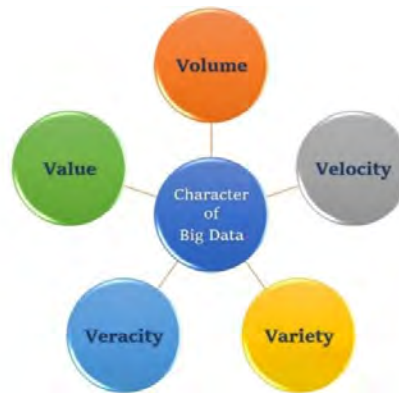
Figure 1. Characteristics of Big Data